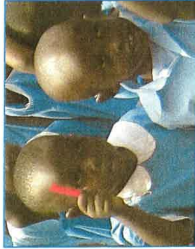
Students receiving licorice treats during a sister parish visit to Christ the King Primary School.

Last year over 100 students benefited from the Sponsor a Student and Scholarship Program. Please consider how you might be able to support these eager to learn children!