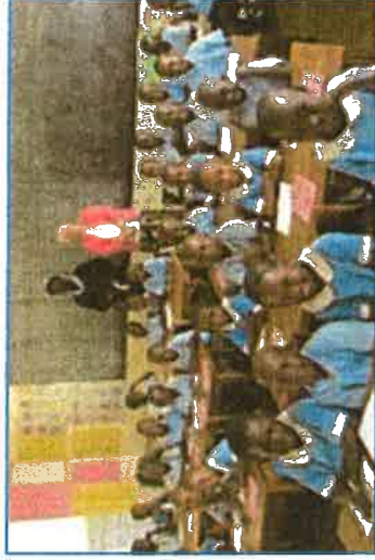
If you can say 'yes' to a child, you are saying 'yes' to the future of our brothers and sisters in Christ, at our sister parish primary school and area secondary schools.